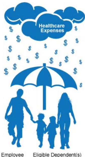
Employee Eligible Dependent(s)

For more information about the Health & Welfare Plan, please refer to the SCPT Health & Welfare Fund Summary Plan Description at www.scptac.org .