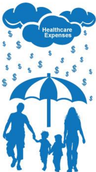
Employee Eligible Dependent(s)

Eligibility will be terminated if the Eligibility Bank balance falls below the Monthly Deduction amount.