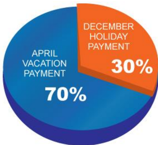
Vacation & Holiday Fund Employee Payout

The default benefit option provides for three benefit payments: