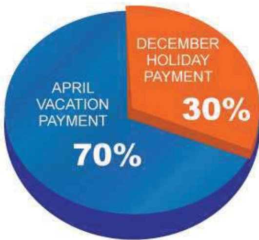
Vacation & Holiday Fund Employee Payout